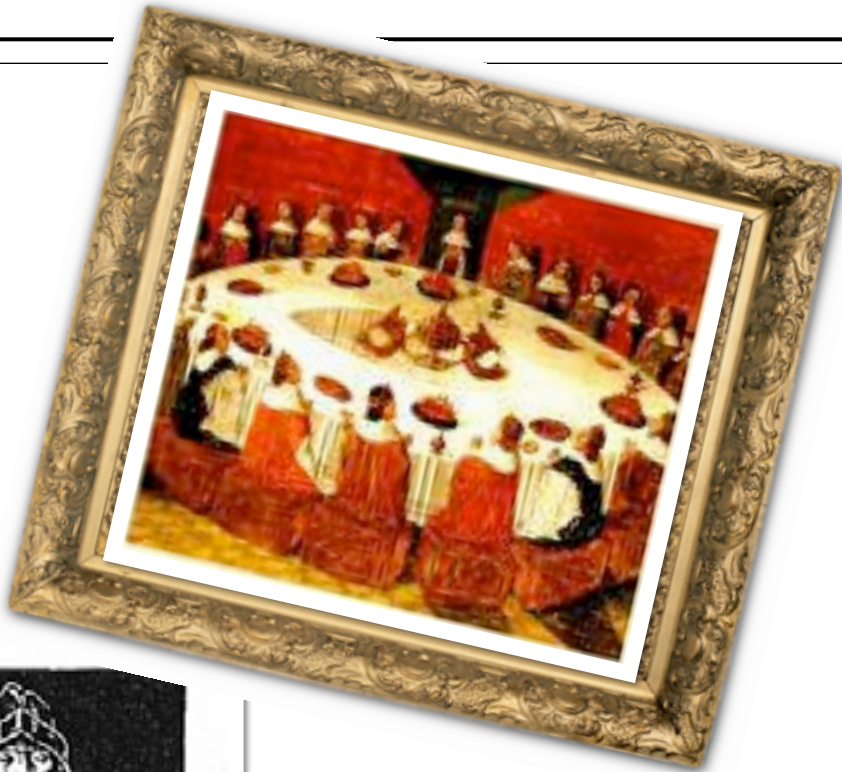
The Knights of the Round Table